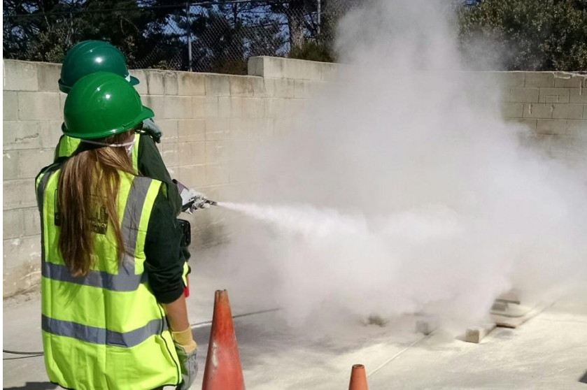
Extinguish small fires