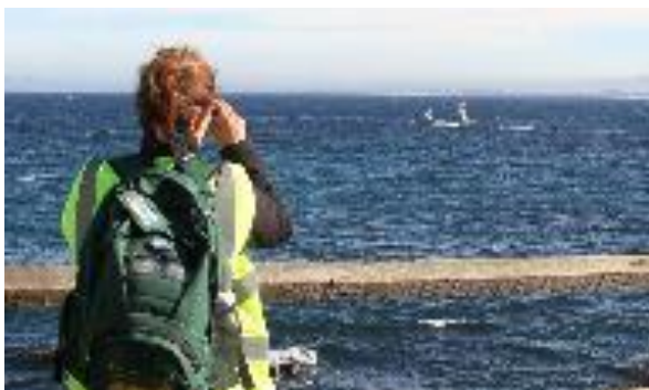
Coastal spotters for missing swimmers