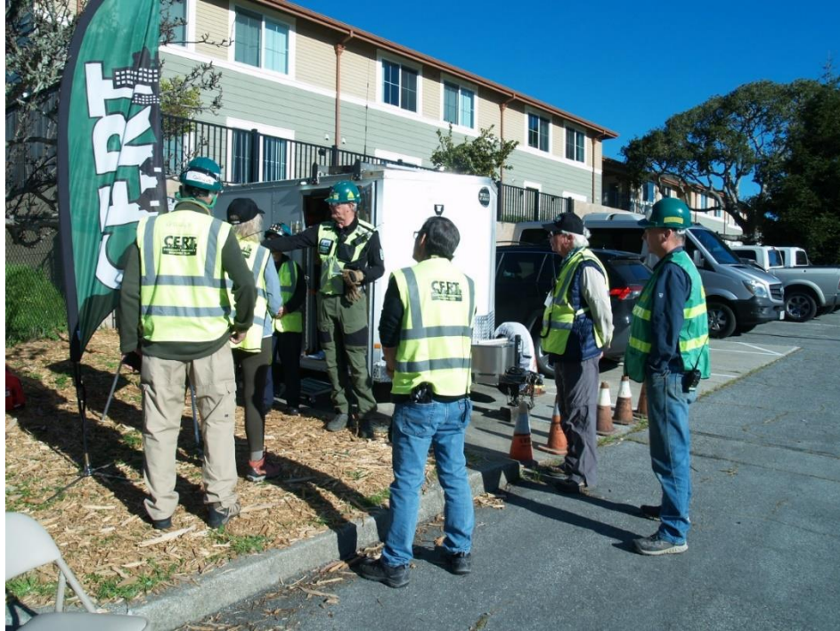
Above: CERT members review improvements made to the CERT trailer and inventory. The man above in the green vest is a CERT member from San Luis Obispo County who came to Monterey to see our training. Monterey CERT networks with many other CERT programs in California as we learn much from each other.