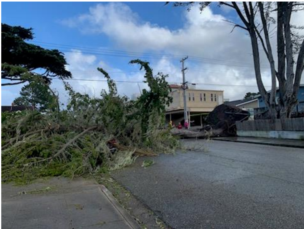
Above: More images from February 4 th taken by CERT members.