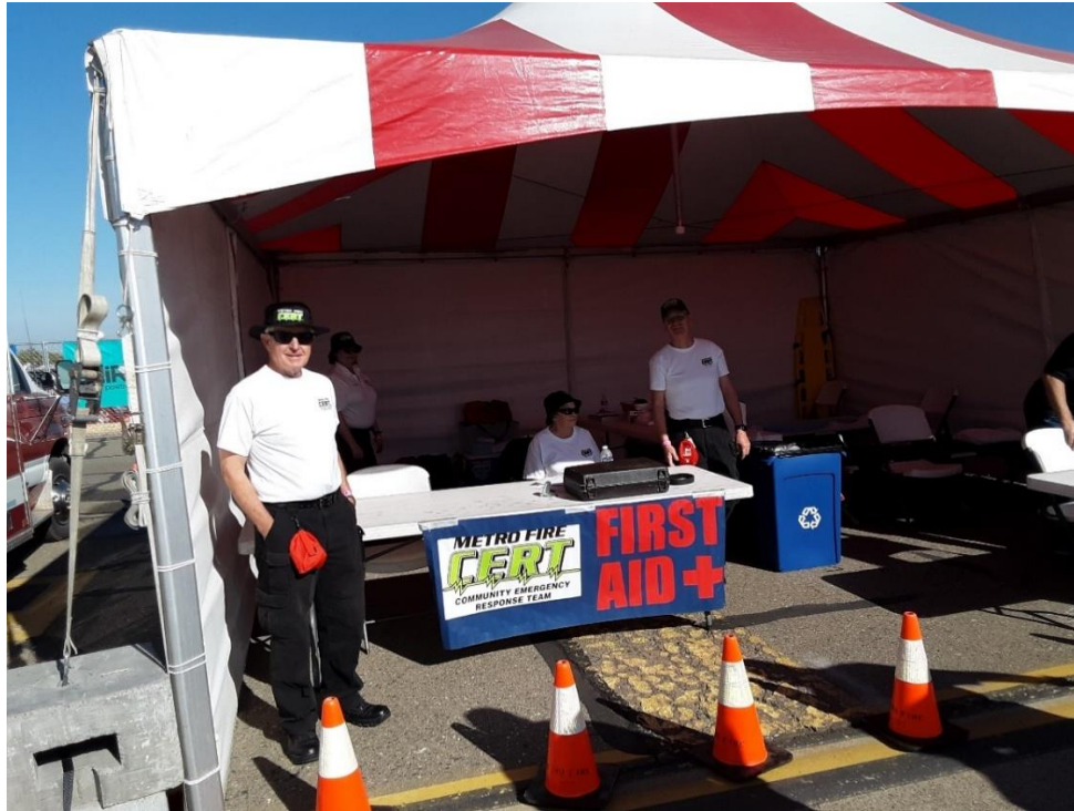
Sac-Metro CERT Volunteers Staff a tent at the airshow

CERT Across America! The Sacramento Metropolitan Fire Department CERT team on scene in September 2018 at the California Capital Airshow in Sacramento! The Sacramento Metropolitan Fire District, "Metro Fire," serves a population of over 745,000 in a 359 square mile service area. Metro Fire is the 7th largest fire agency in the State of California.