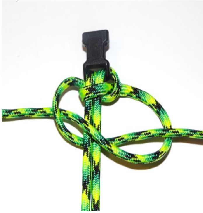
Left strand now goes over right strand, under the 2 core strands and up through the loop between the right strand and 2 core strands.