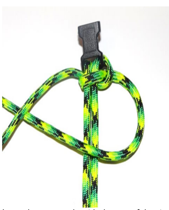
Loosely snug up knot being careful not to change length of bracelet. Alternating, now cross right strand over the 2 cores strands.