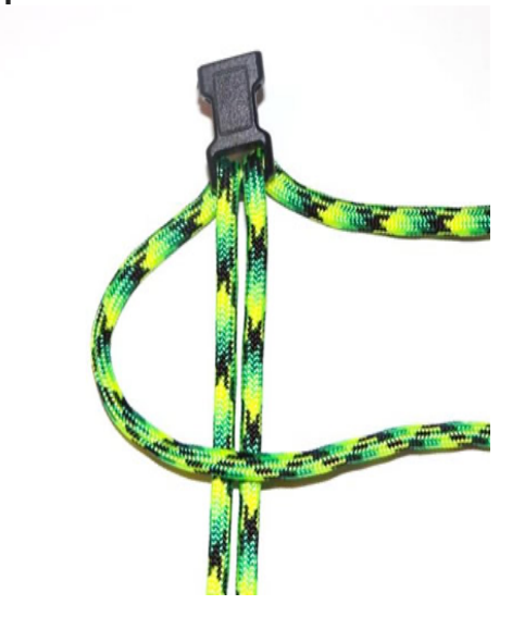
Flip left strand over the 2 core strands.