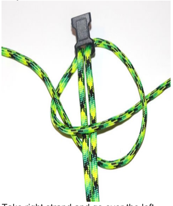
Take right strand and go over the left strand, under the 2 core strands and up through the loop between the left strand and the 2 core strands.