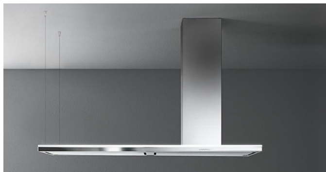
Photograph is for information purposes only May not correspond to the selected version