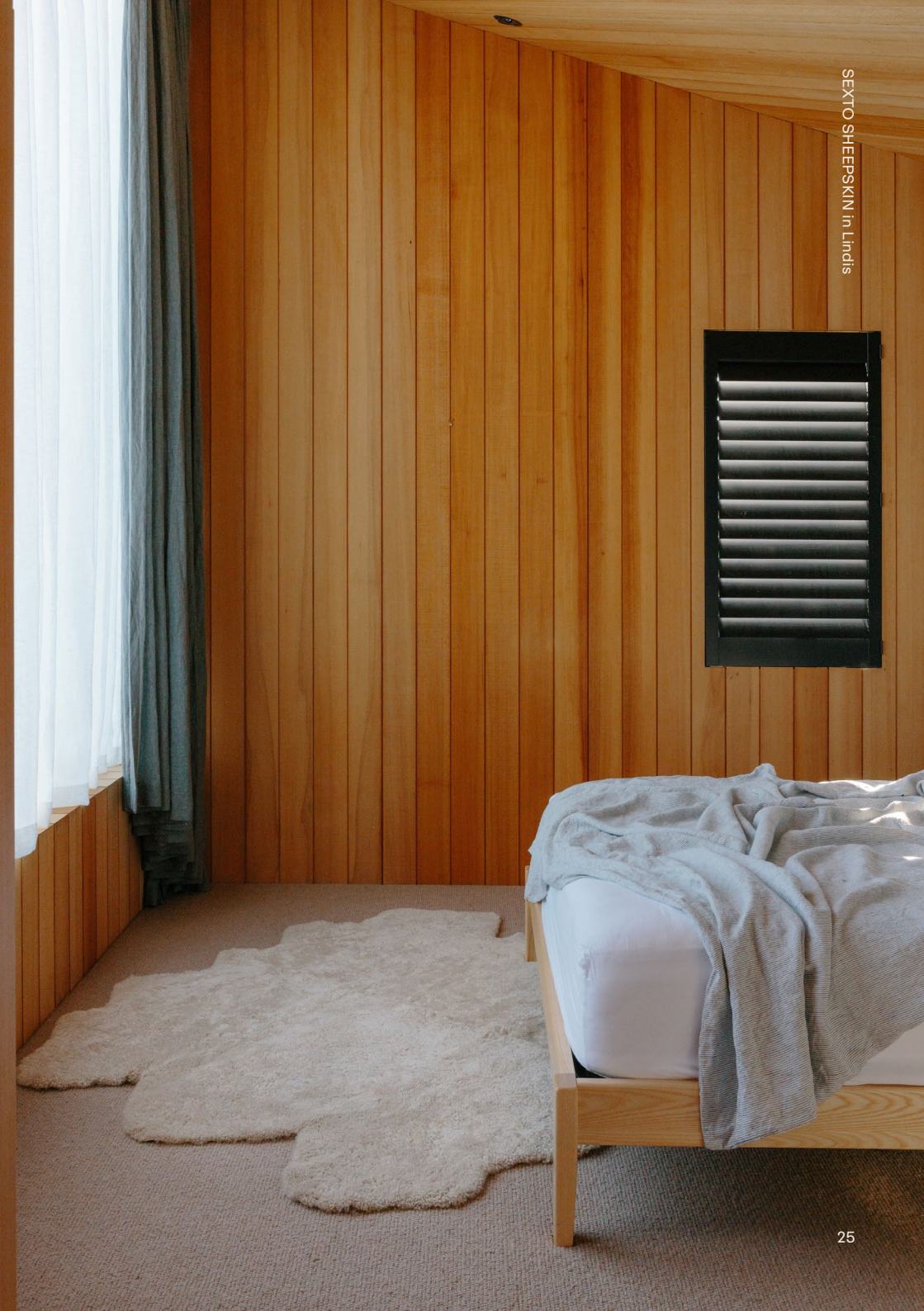
SEXTO SHEEPSKIN in Lindis