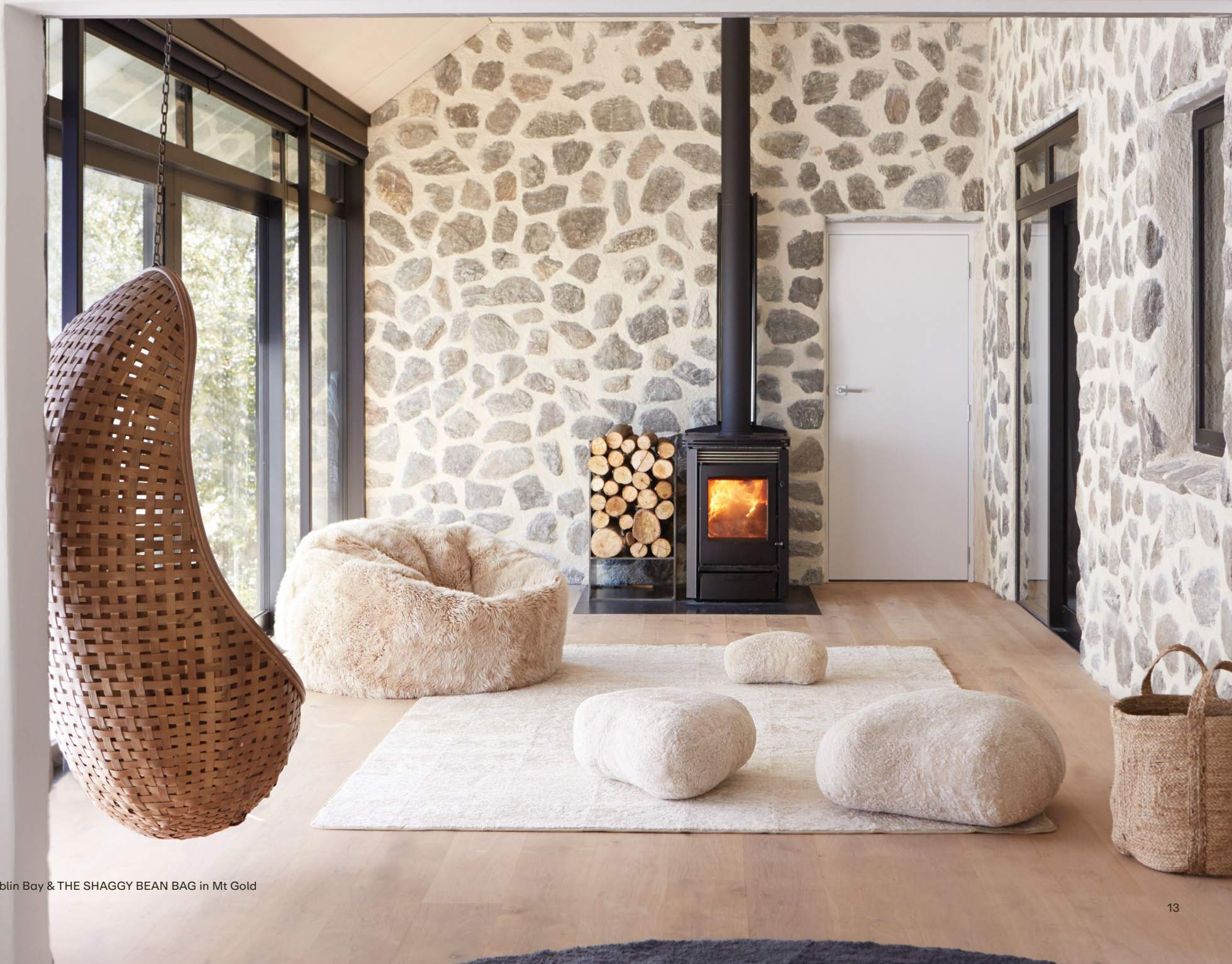
THE STONE SET in Dublin Bay & THE SHAGGY BEAN BAG in Mt Gold Wilson & Dorset