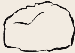
SHAGGY BEAN BAGS

No fuss and endlessly versatile, sheepskin at its simplest.