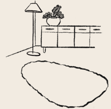
DESIGNER FLOOR RUG

The ultimate underfoot sheepskin experience.