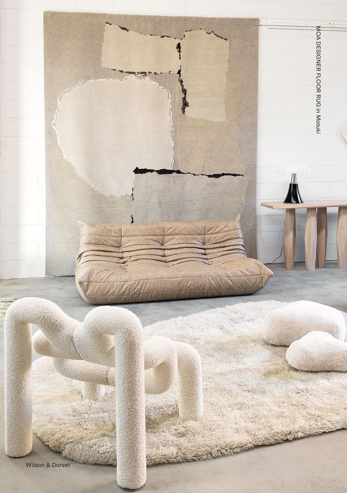
MOA DESIGNER FLOOR RUG in Mattuki