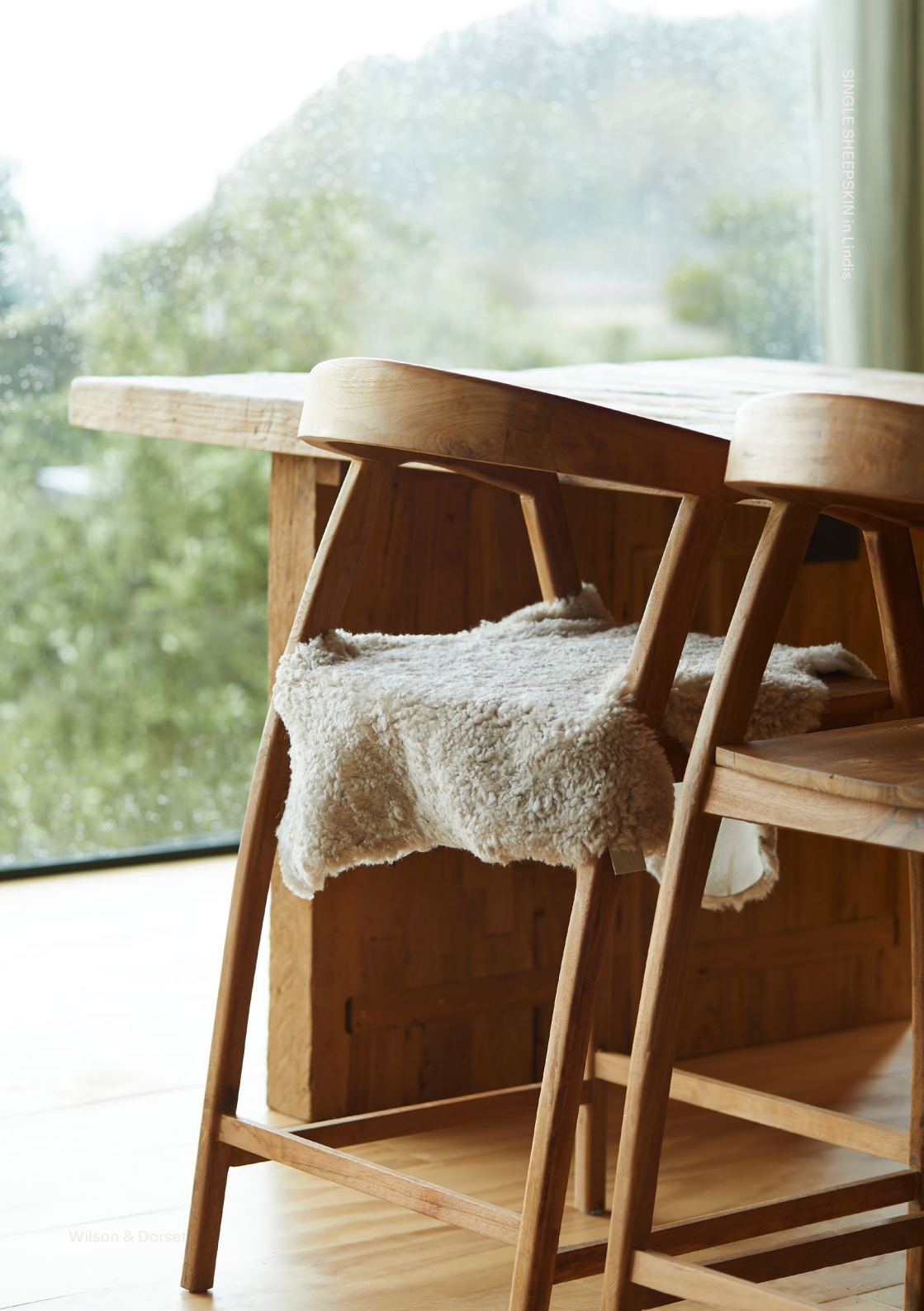
SINGLE SHEEPSKIN in Lindis