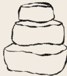
THE STONE SET