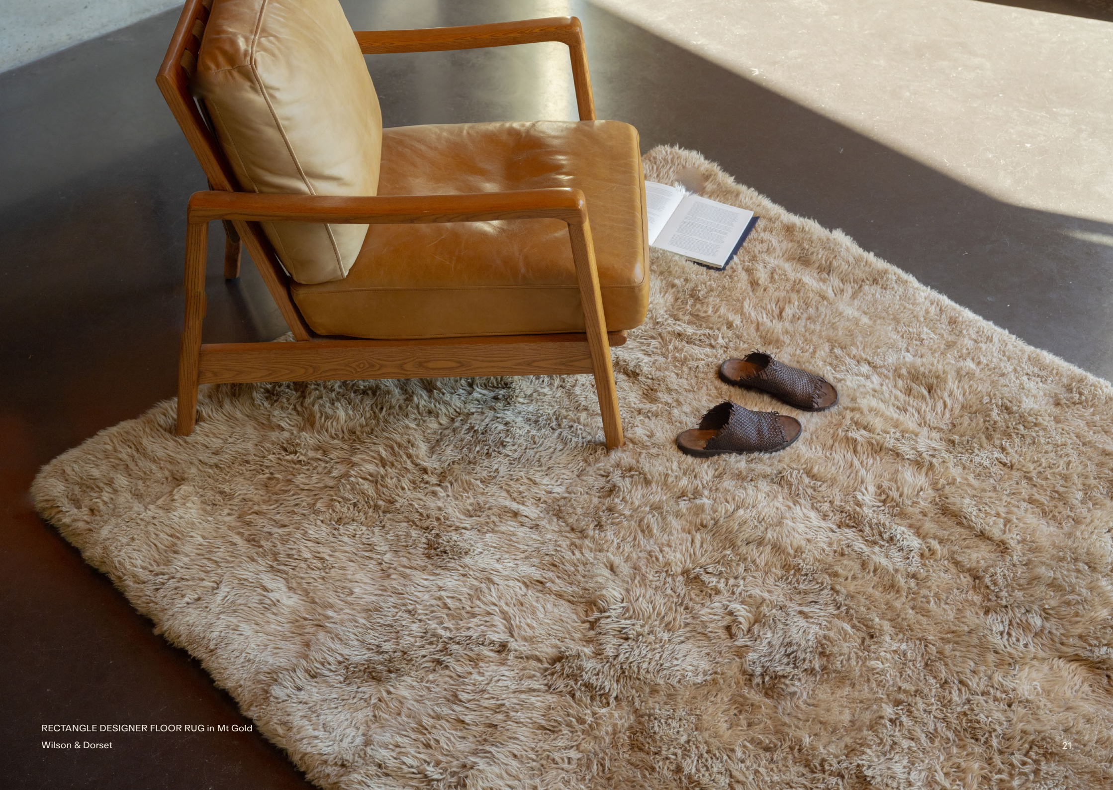
RECTANGLE DESIGNER FLOOR RUG in Mt Gold Wilson & Dorset