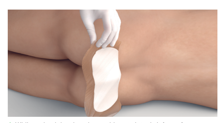
4. While maintaining dressing position at gluteal cleft, perform assessment of skin.