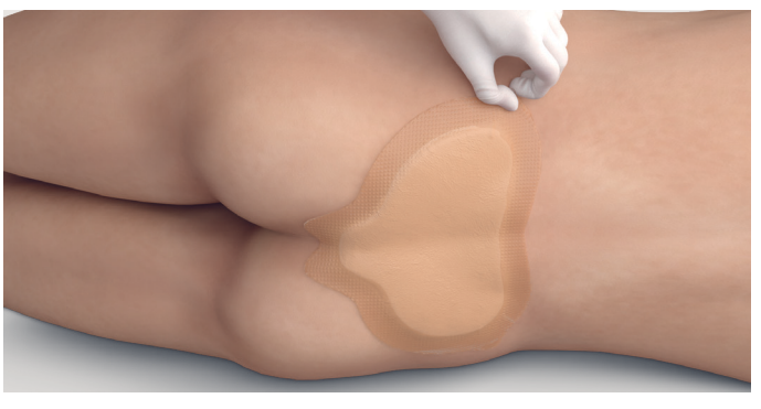
2. Gently pull handling tabs to begin to release dressing from skin.