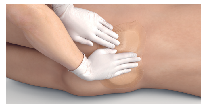
{\bf 6.} Press and smooth the dressing to ensure the entire dressing is in contact with the skin.