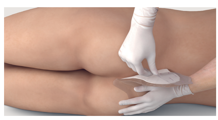
4. Remove side release films and gently smooth each side into place.