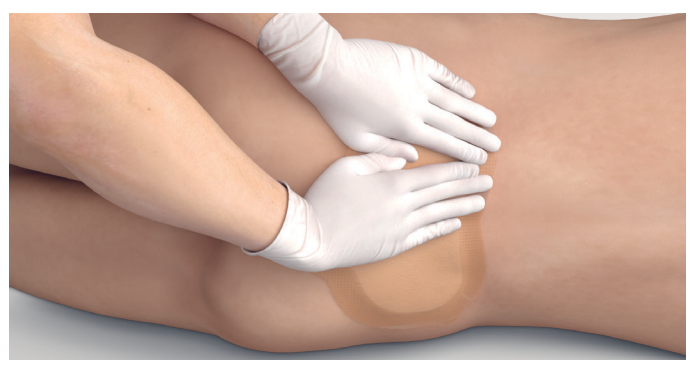
5. Reapply the foam and borders of the dressing.