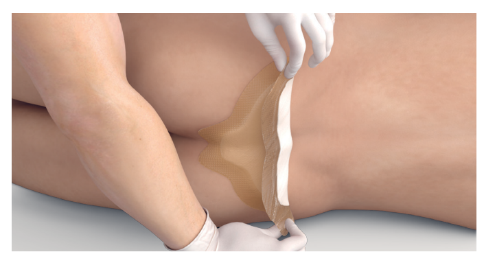
3. Continue to release dressing from skin using handling tabs until skin exposed for skin check.