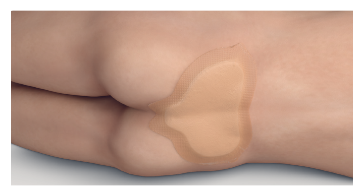
1. Assess to confirm dressing is intact and applied correctly.