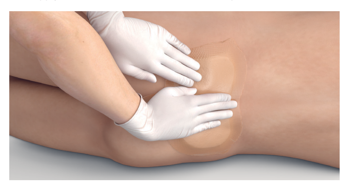
7. \ \mbox{Press} and smooth the dressing to ensure the entire dressing is in contact with the skin.