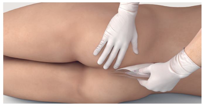
3. Hold buttocks apart. Apply dressing to sacral area and into upper aspect of gluteal cleft, with dressing 'base' positioned to cover coccyx area.