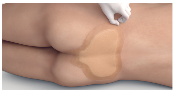
6. Confirm dressing is replaced to its original position, making sure the border is intact and flat.