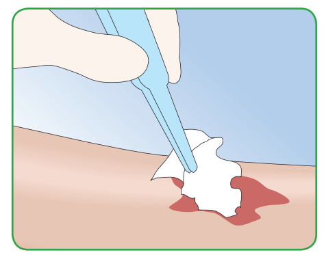
Loosely fill deep wounds, ensuring the dressing does not overlap the wound margins. Apply to wound bed directly.