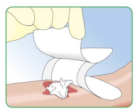
Cover and secure Melgisorb Ag with a secondary dressing.