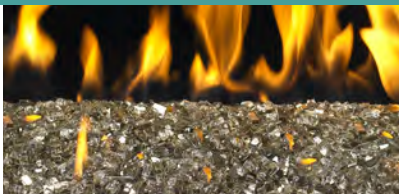
Bronze Reflective GL-**-ZR