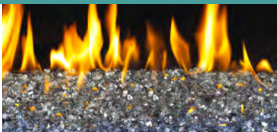
Caribbean Blue Rfl GL-**-NR