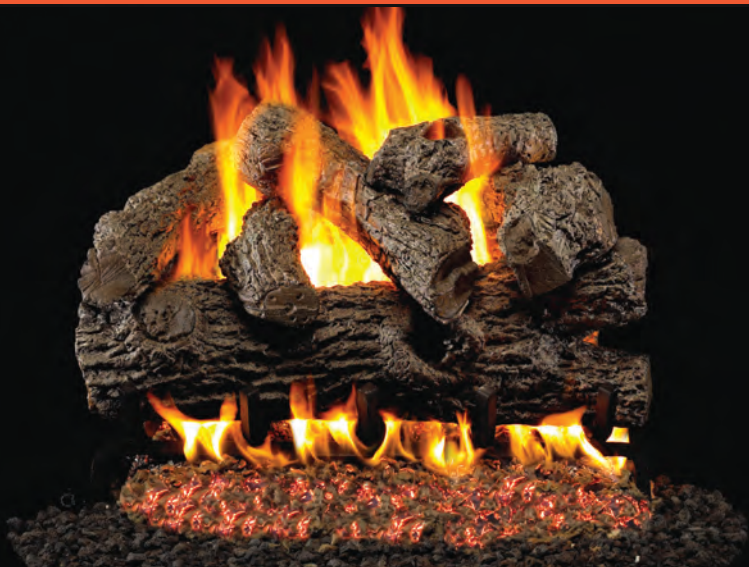
Coastal Drift Wood (CDR) Sizes: 18", 24" & 30"