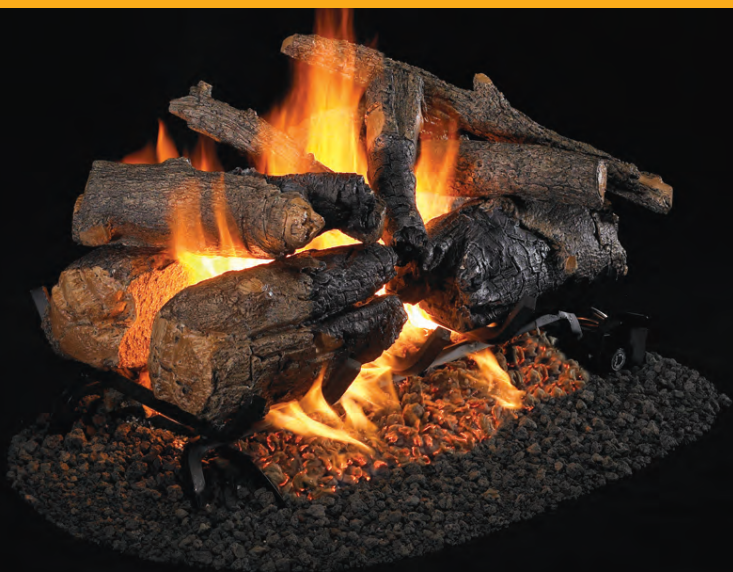
Rugged Split Oak See-Thru (RRSO-2) Sizes: 18" & 24"