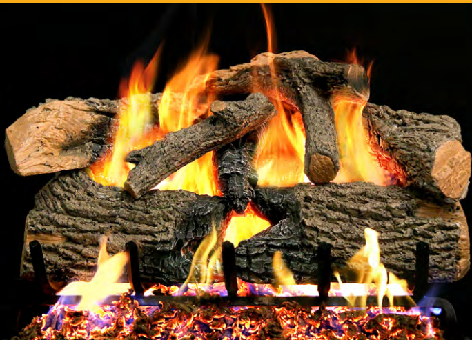
Charred Oak See-Thru (CHD-2) Sizes: 18" - 30"