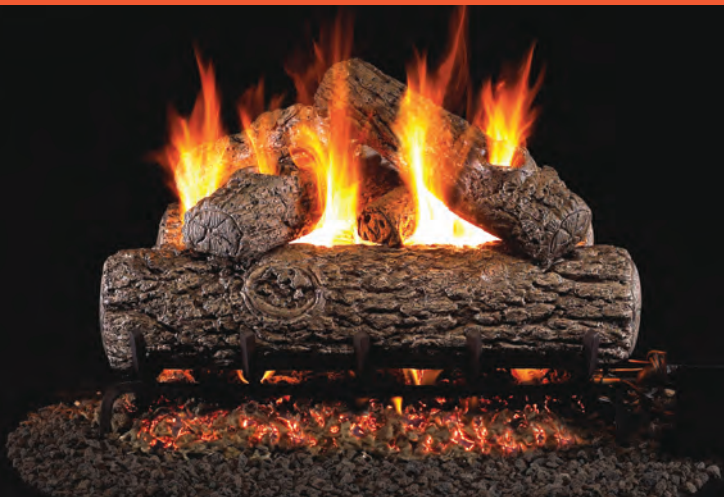
Royal English Oak (B) Sizes: 18", 24" & 30"