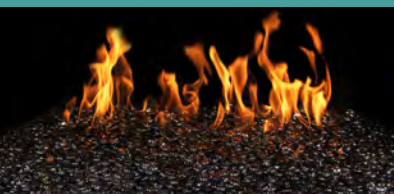
Black Granite GLG-**-B