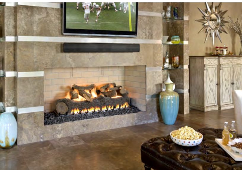
Mammoth Pine (MP) Sizes: 24" - 36"

Experience a specialty set from Real Fyre and experience what's special.