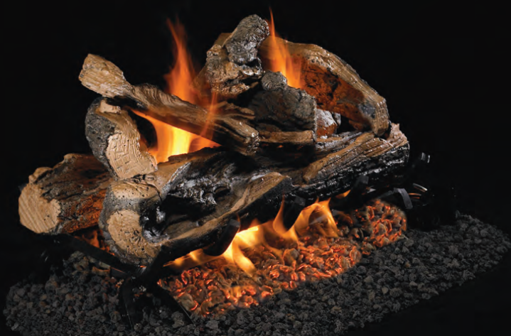
Golden Oak See-Thru (R-2) Sizes: 18" & 24"