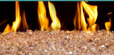
Champagne Rfl GL-**-CR