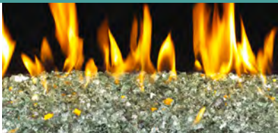
Emerald Reflective GL-**-ER