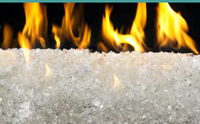
Star Fyre GL-**-W