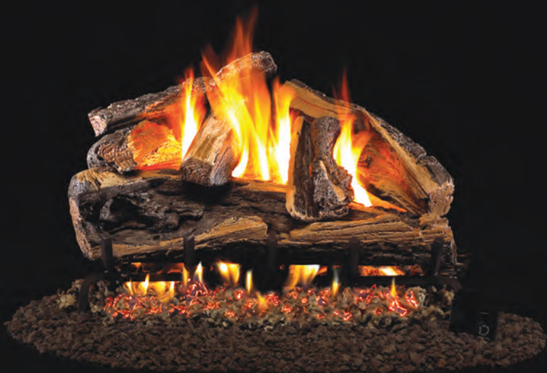
Gnarled Split Oak (GSO) Sizes: 24" - 36"