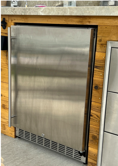
Image of the fridge inside the outdoor kitchen.

When you submit images of the refrigeration please include the following images