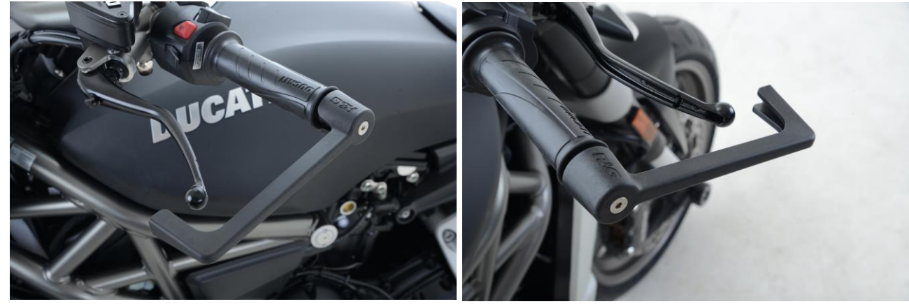
PLEASE ENSURE THAT THIS PRODUCT WILL FIT BEFORE ANY REMOVAL OR MODIFICATIONS OF PARTS ARE MADE TO YOUR MOTORCYCLE