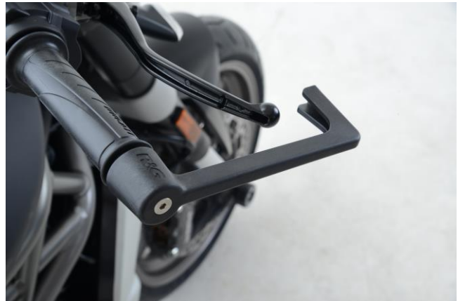
ASSUREZ VOUS DE LA COMPATIBILITE DU PRODUIT AVANT DE DEMONTER OU DE MODIFIER QUOI QUE CE SOIT SUR LA MOTO.

Le kit contient les articles exposés ci-dessous, vérifier que toutes les pièces soient présentes avant de procéder au montage.