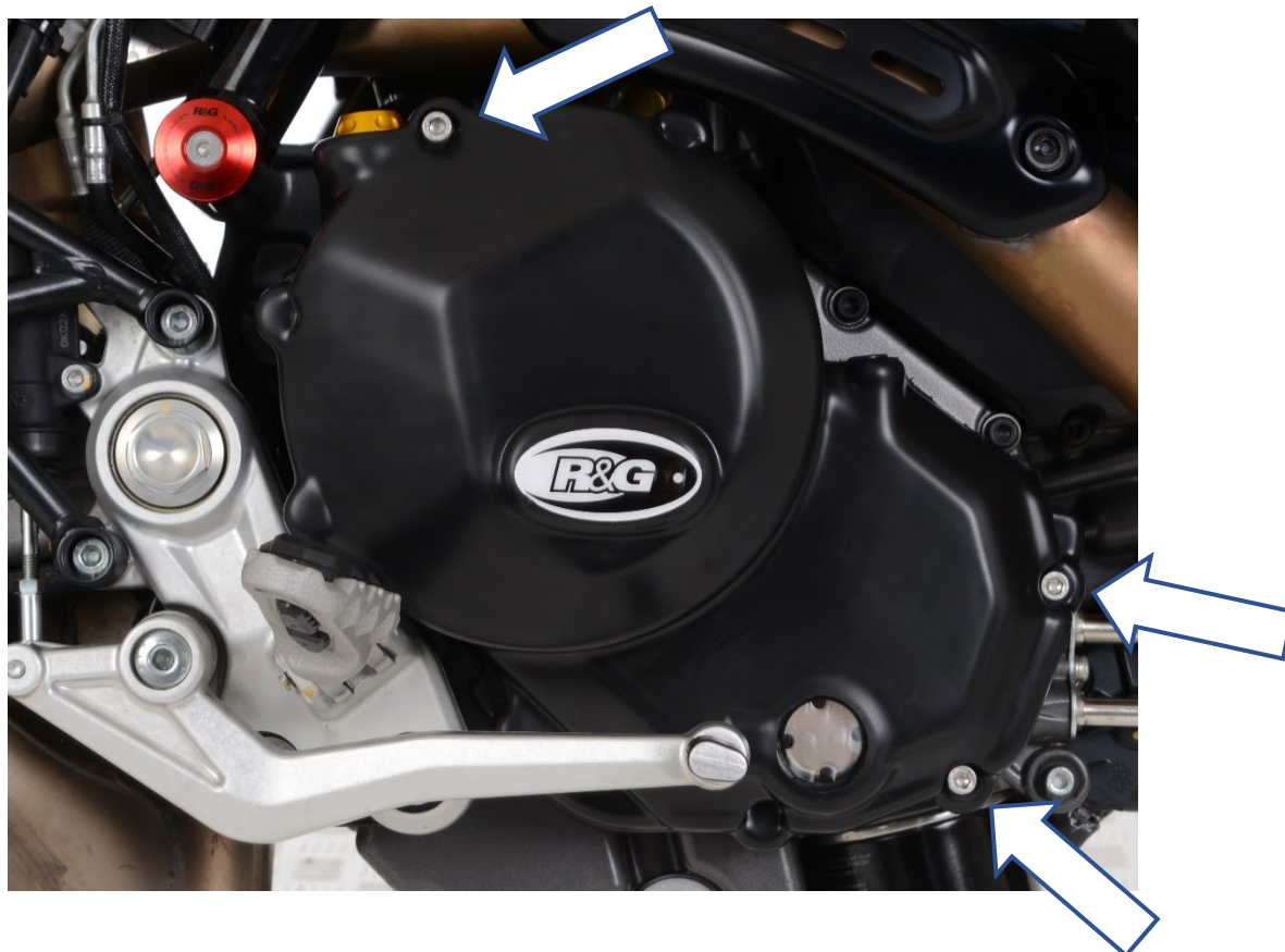
SCHÉMA DE MONTAGE