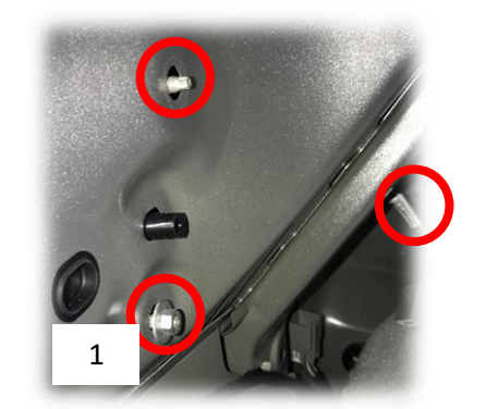
Figure 1: Factory taillight nuts