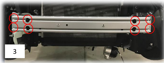
Figure 3: Factory front bumper bar

This bumper bar is designed for off road competition use only and is not covered under any warranty stated or implied.