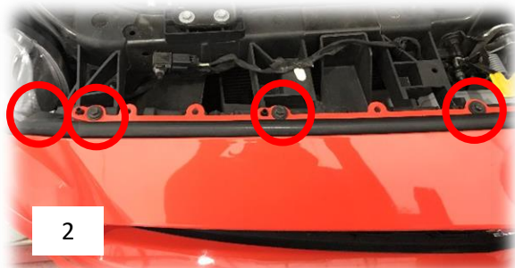
Figure 2: Top bolts on front bumper