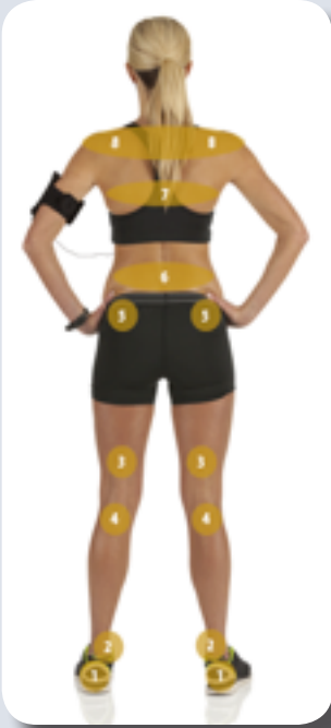
Figure 4: Since the Kinematic Chain links the entire body, stimulation in one key location resonates throughout the entire body.

This slow motion analysis highlighted not only the increased firing, but also the synchronization of Peroneus and Anterior Tibialis occurring at pre heel strike. Muscles that play this important role in the preparation for contact are also controlling what happens throughout the rest of the body prior to impact (e.g. controlling and limiting excessive pronation in the first segment of gait). Additionally, the muscles involved in the toe off segment of gait can be contributors to more