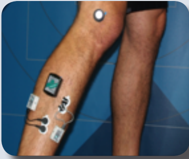
Figure 1: Noraxon Surface Electromyography Measurement solution with electrode placement set-up