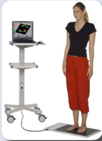
Figure 2: Noraxon MyoPressure Analysis for Dynamic measurements – gait, balance, and even static posture assessment. Balance was quantified by the FDM-SX gait platform, before and after wearing BFS for only a short period.

on the FDM-SX for 10 seconds, parameters including the geometric 95% Confidence Ellipse Parameters and the Center of Pressure Parameters were generated to establish a baseline. This was also done while baseline muscle activation was recorded. Muscle activation of the Peroneus and Anterior Tibialis were additionally examined during dynamic gait.