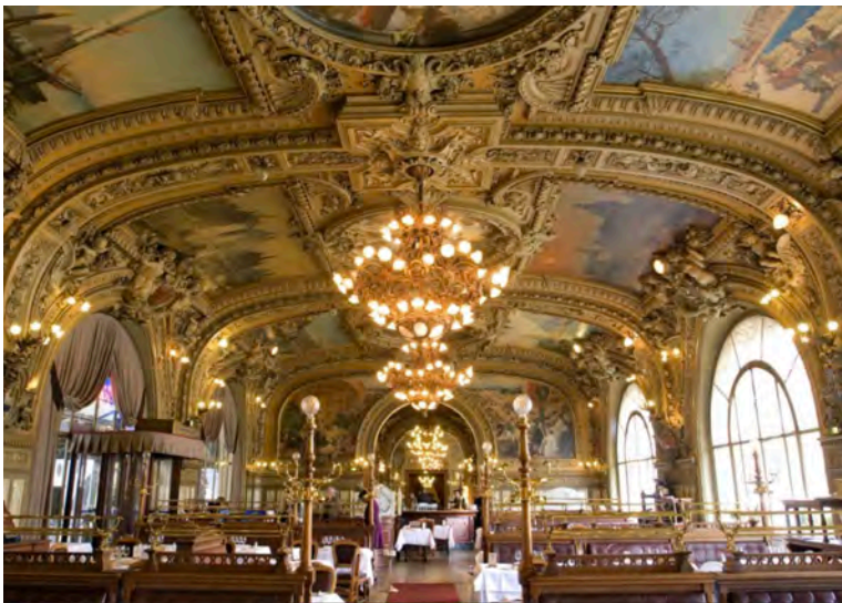
Le Train Bleu Restaurant inside the Gare de Lyon

Paris Gare de Lyon, the third busiest railway station in France and one of the busiest in Europe, handles approximately 90,000,000 passengers every year. It is the main train line from Paris to the south of France.