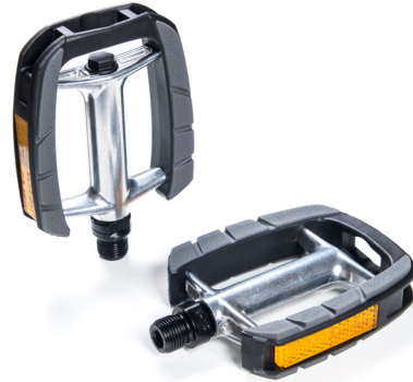
City pedals, City / Trekking bike