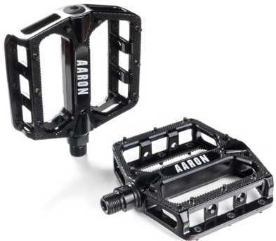
Rock pedals, Mountain bike