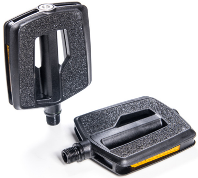
Urban pedals, City / Trekking bike