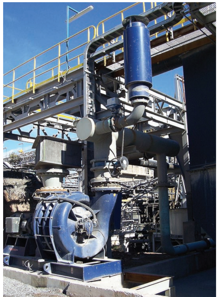
Three Power Mizer Series 7000 blowers are installed in a copper mining operation in Chile.

Email marketing@spencer-air.com or visit www.spencerturbine.com to locate a Spencer representative.