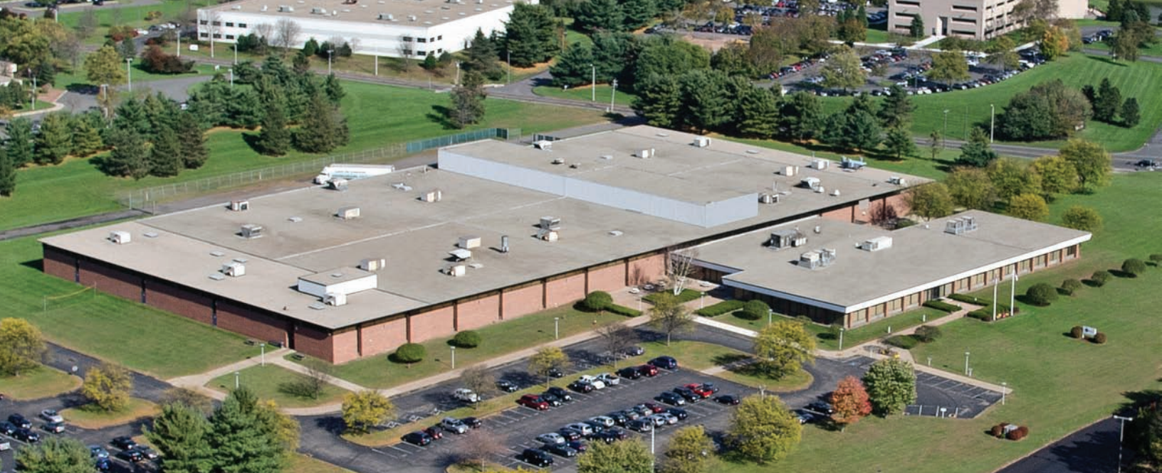
Spencer Corporate Headquarters and Manufacturing Plant, Windsor, CT USA