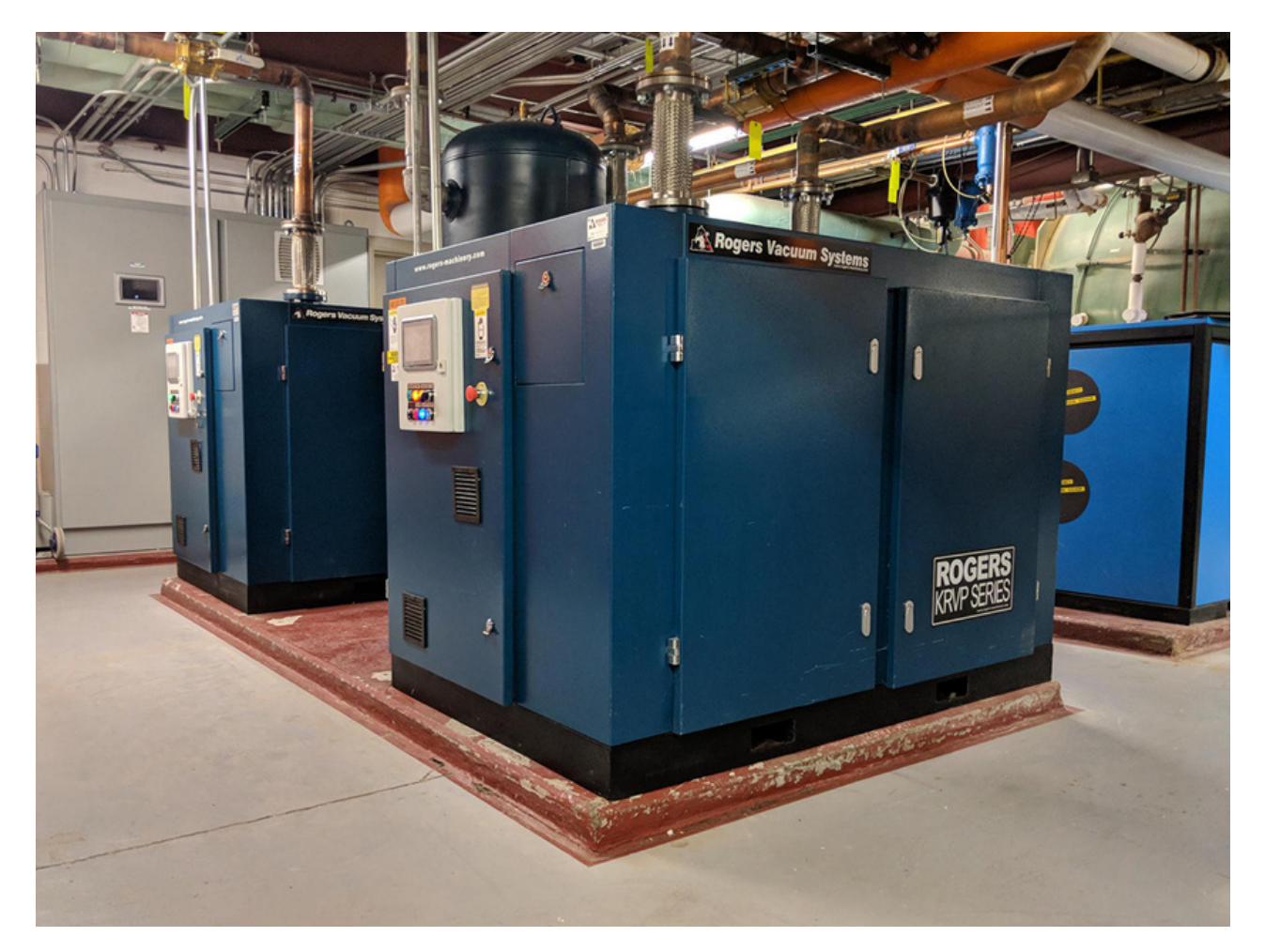
A Rogers Machinery KRVP vacuum pump installed in a facility.

With a patented flexible discharge port, Rogers KRVP vacuum pumps can operate at full flow from initial atmospheric pressure all the way down to your system pressure requirements.