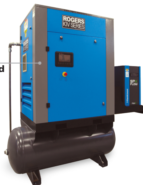
Tank Mounted with Dryer