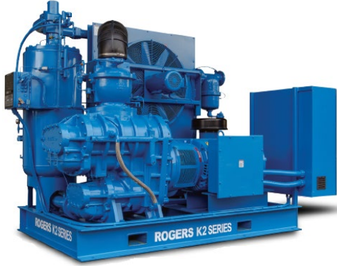
K2 / K2V SERIES (Open Frame Compressors)