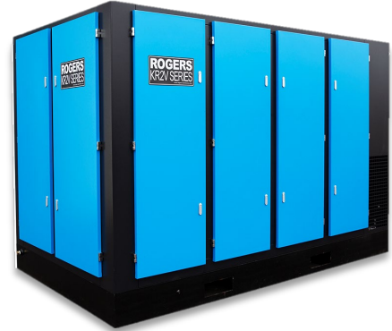
KR2 / KR2V SERIES (Enclosed Compressors)