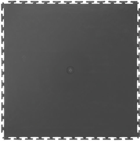
Back of Our Tiles

When you're shopping for something you need, price is going to be one of your top considerations. Everyone wants to be sure they've got value for money and everyone loves a great deal! But what might seem like a great deal when you're comparing products online may not be value for money in the long term. Here's what to look out for when you're buying garage floor tiles and comparing tiles made in the UK with cheap imports.