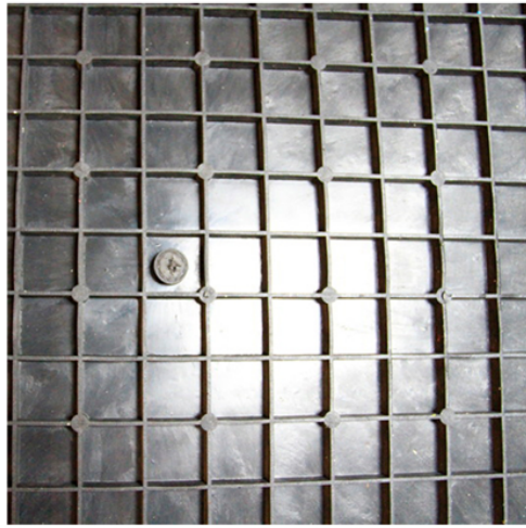
Back of Competitors Tiles