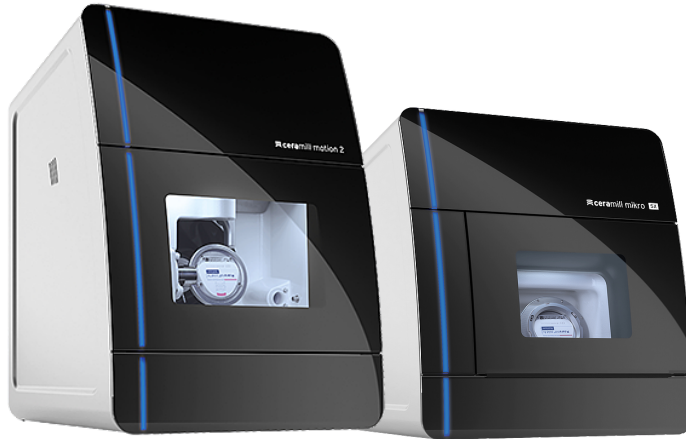
ceramill® motion 2

BUY A MOTION 2 AND GET A MIKRO 5X FOR $10,000!