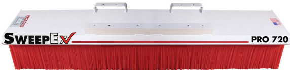
SPB-720 72-INCH PUSH BROOM