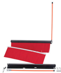
DCE-020-1 DEBRIS COLLECTOR ENDS

Mega-Broom Brush Section Kit. Pack of 8.