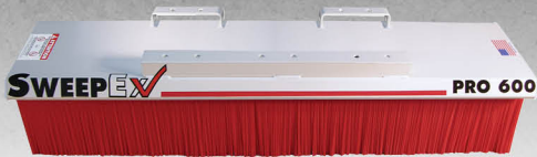
SPB-600 60-INCH PUSH BROOM