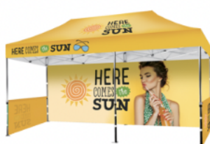
10'x15' & 10'x20' Premium