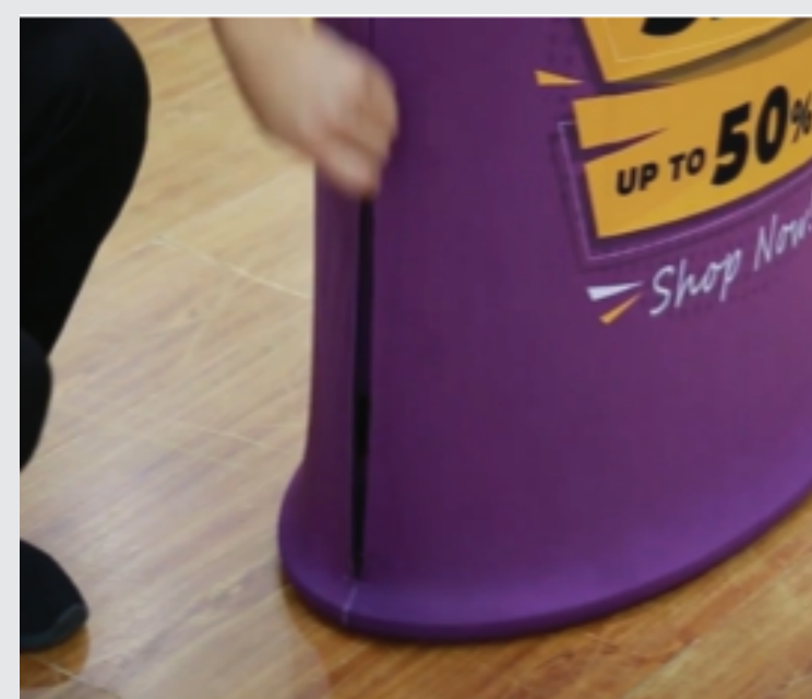
Open the zipper on the side of the graphical fabric to put the LED lights. Connect the power to supply and to light the lamps.