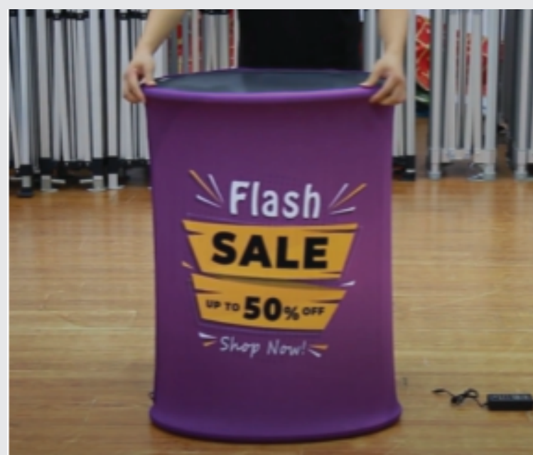
Remove all contents of the bag.