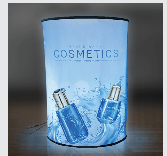
Your Pop-N-Go Light-Up Counter Display is now ready!