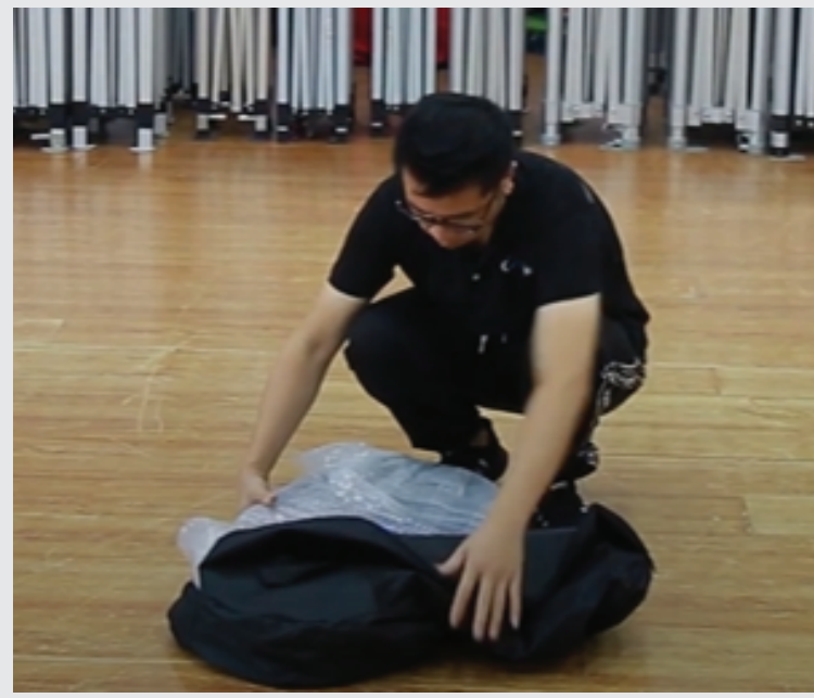
Remove all contents of the bag.

In addition to being able to pull up and lay down within 5 seconds, it's also equipped with bright white LED lights inside that will draw more attention to your booth!