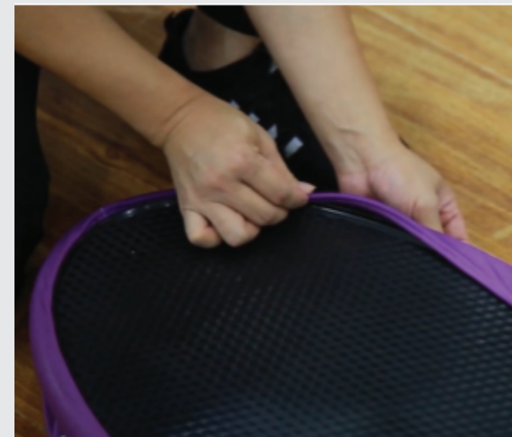
Secure the graphical fabric by tucking in the edges of the fabric to the sewn silicone strips. Silicone strips are sewn at the bottom and top of the frame.