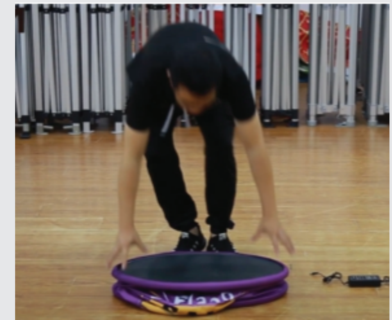
Once the graphical fabric is attached, press the top board with your hands and it will rise automatically.