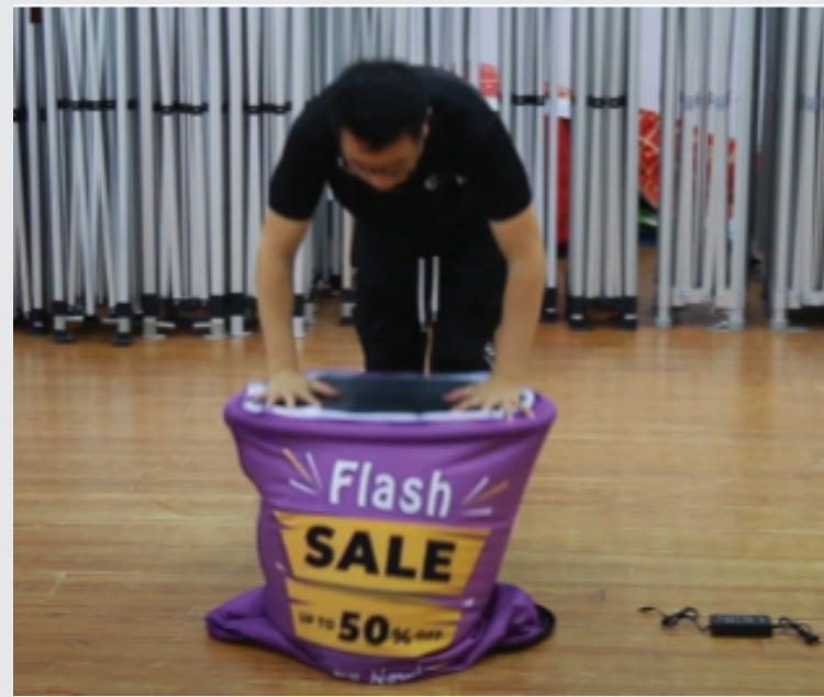
Push down the frame to secure the graphical fabric at the bottom part of the frame. Flip the frame for better convenience.