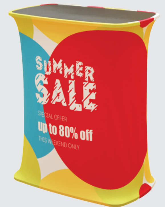
Your HassleFree™ Square Counter Display is ready!