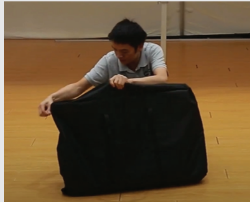
Remove all contents of the bag and lay them on the floor.

Pop n' Go Counter Display comes with an internal spring system that allows your display to pop open in just seconds. Includes Carry Case.