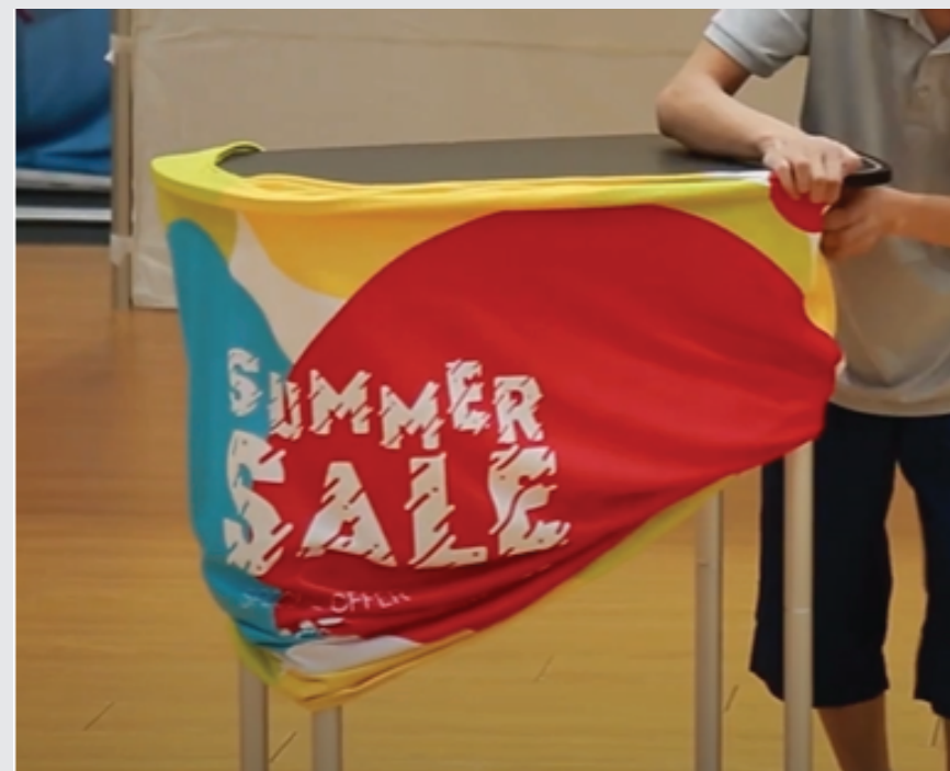
When the frame is ready, slide the graphical fabric to the frame. Secure the fabric by tuckin in the edges that has a sewn silicon strips.