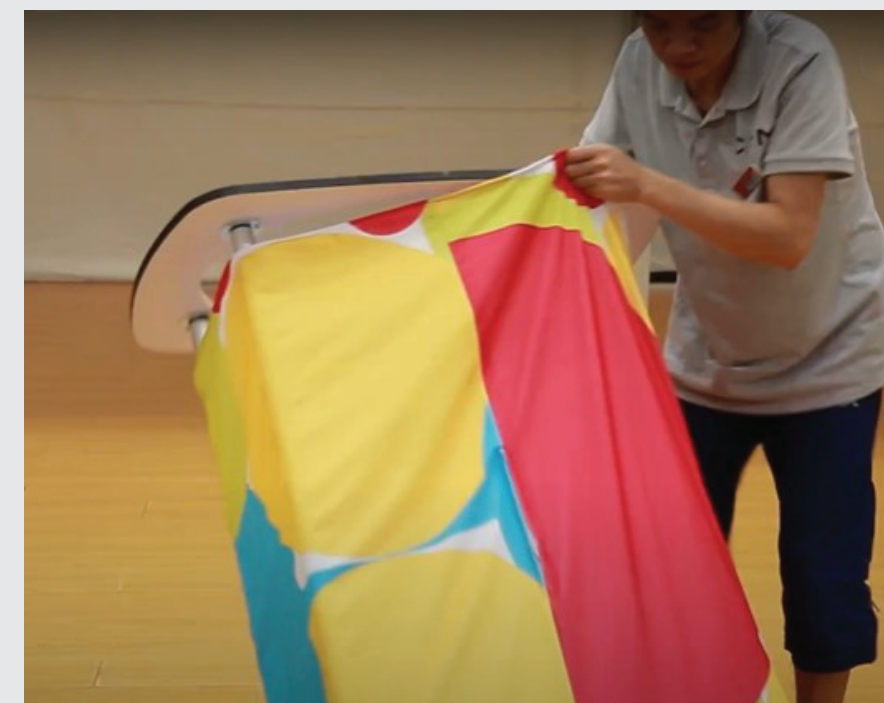
Turn the frame upside down to secure the fabric at the bottom part of the counter display.