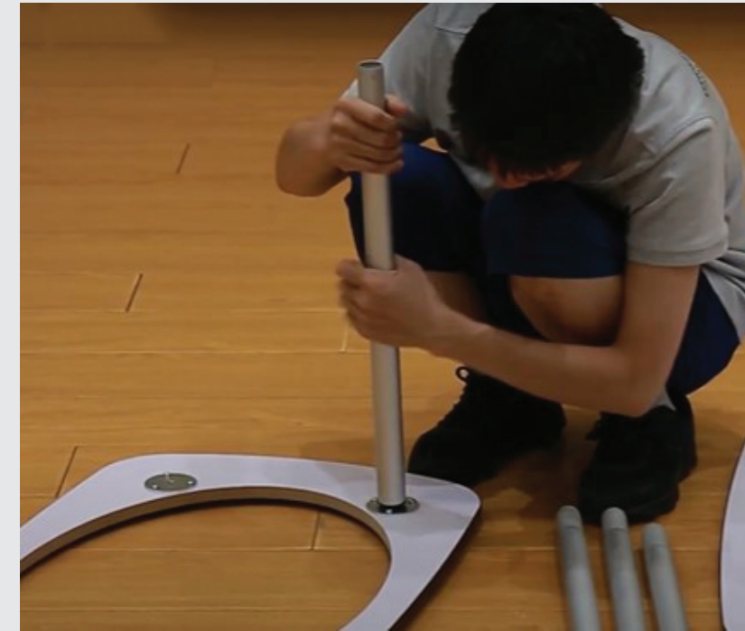
Fix the bars by screwing properly the tubes.