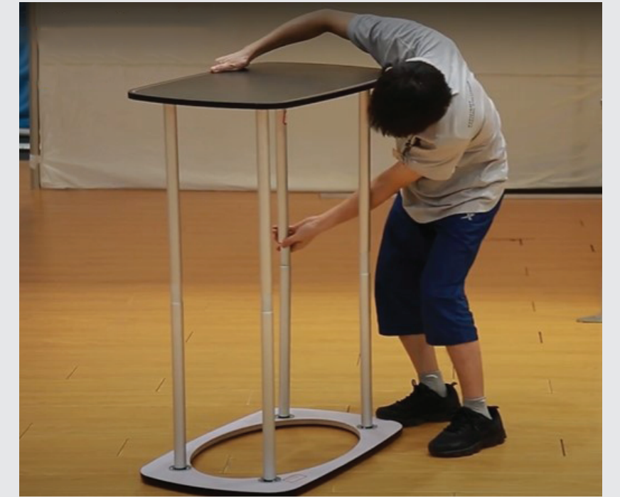
Connect the 2 parts together.