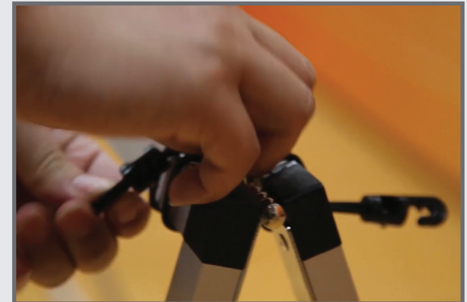
Attach the hook bungee cords for your graphic.