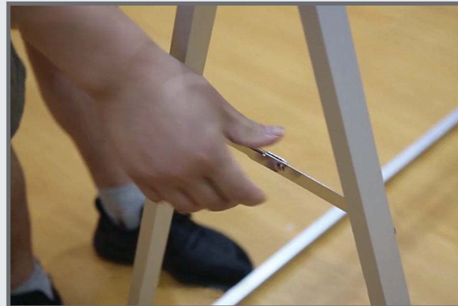
Secure the frame by pushing the hinges down to lock position.