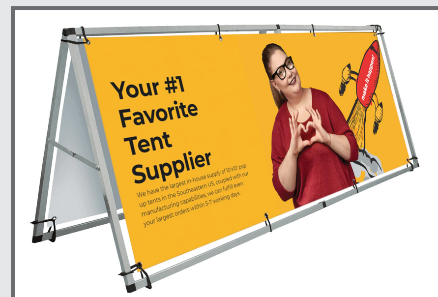
Your Aluminum Perimeter Display is now complete.