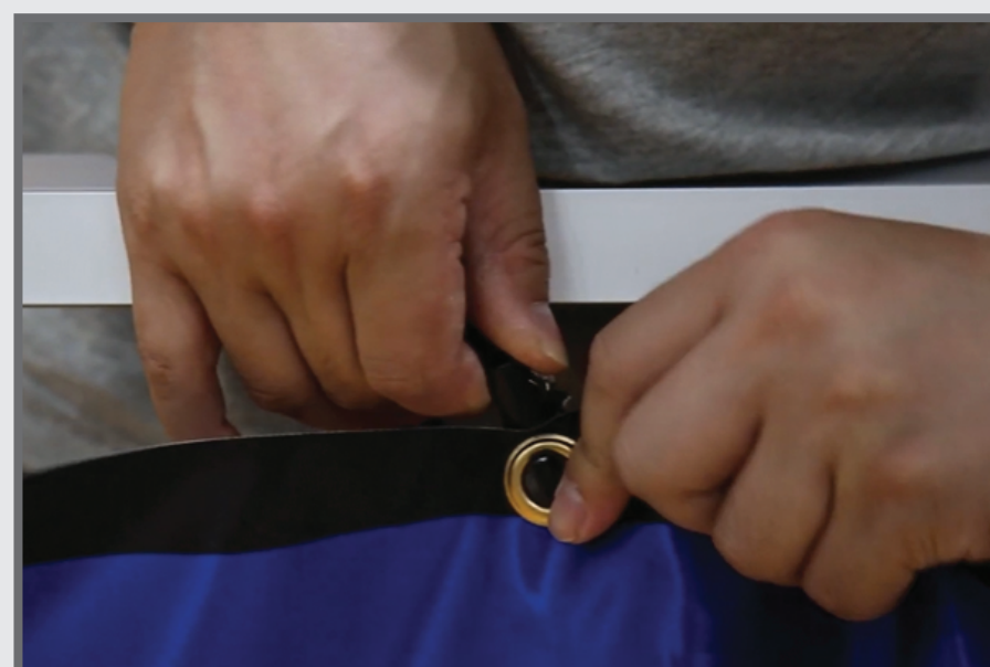
Once all bungee cords are attached to the frame, connect your graphic by hooking your banner's grommets.