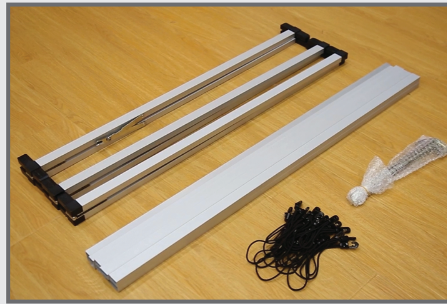
Prepare all parts from the bag.