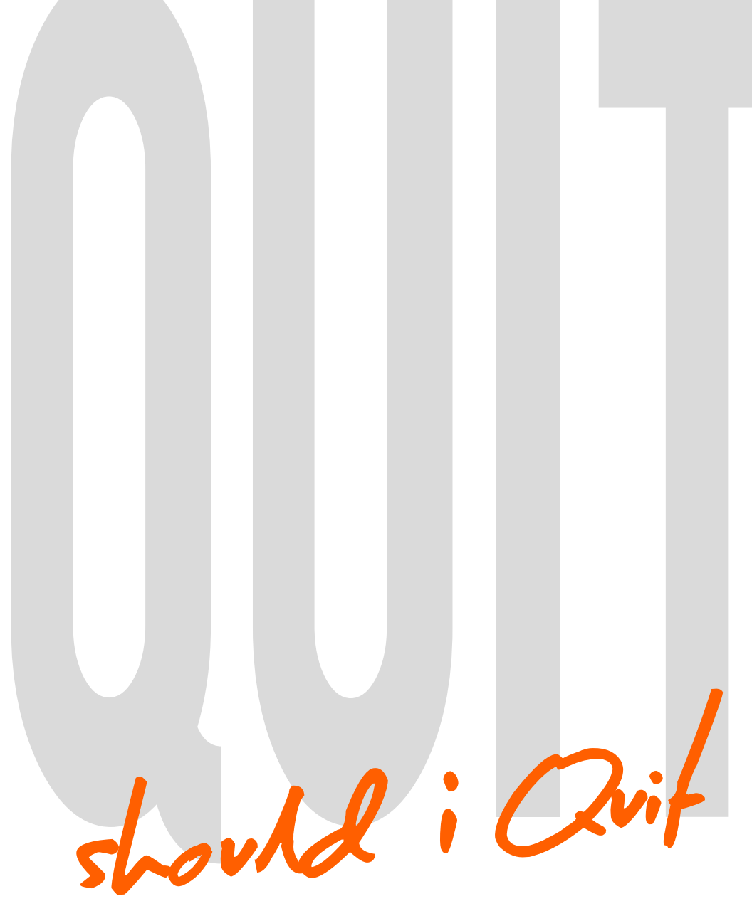
5 STEPS TO DIS(OVER WORK YOU ARE MEANT TO DO & LIVE YOUR PURPOSE