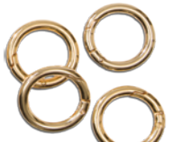
1.5" GOLD (4pk) $19.95