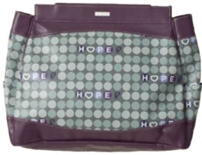
HOPE PURPLE tote

Smooth grey faux leather with plum accents and delightful polka dots in varying shades of purple and grey. $79.95 shell only