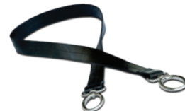
SHOULDER STRAP 94cm $19.95