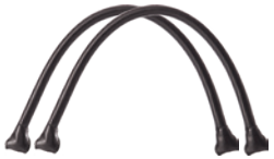
CLASSIC BLACK 30.5cm (set of 2) $14.95