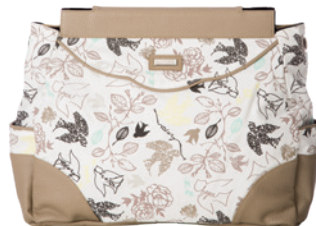
HOPE DOVE tote

White canvas screen printed dove and floral pattern with subtle "hope" script with taupe accents in faux leather.