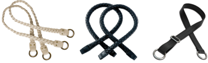
BRAIDED CREAM 58cm (set of 2) includes carabiners $29.95 BRAIDED BLACK 61cm (set of 2) $29.95 ADJUSTABLE BLACK STRAP 56cm – 99cm $19.95 each or (set of 2) $29.95