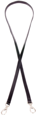
MINI LONG BLACK HANDLE L: 122cm $19.95