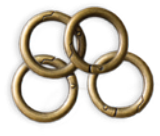
1" BRASS (4pk) $16.95