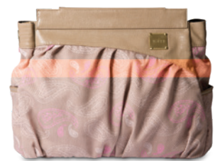
HOPE PAISLEY tote

Orange stingray-textured faux leather with subtle snake skin print overlay. Tangerine faux leather accents with detachable tassel. $79.95 shell only