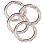
1" SILVER (4pk) $16.95