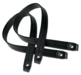
BLACK STRAPS (set of 2) SHORT 53cm $14.95 MEDIUM 58cm $14.95