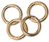
1" GOLD (4pk) $16.95