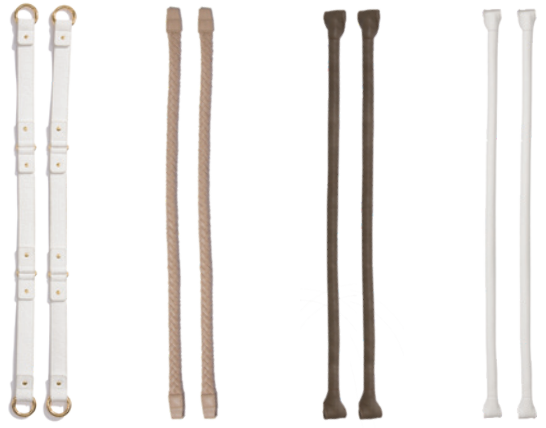
WHITE CROC 56cm (set of 2) $29.95 TAN ROPE 59cm (set of 2) $29.95 TAUPE 59cm (set of 2) $29.95 ROLLED WHITE 53cm (set of 2) $29.95

Handles & Straps are all Interchangeable