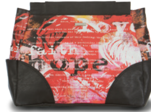
HOPE RED tote

Creamy tan and black snakeskin with a silvery shimmer and black faux leather detailing. $79.95 shell only