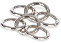
CONVERSION KIT $24.95