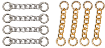
INTERCHANGEABLE CHAIN SET GOLD OR SILVER Set of 4 bright gold or silver chains that work with all Interchangeable Handle Straps $39.95