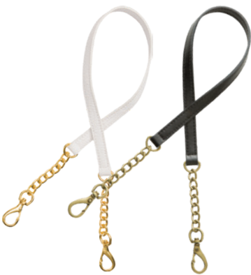
MINI WHITE CROC WITH GOLD HANDLE L: 62cm; Handle drop: 29cm $19.95 MINI ANTIQUE WITH BRASS HANDLE