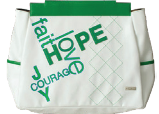
HOPE ARGYLE tote

Faith, hope and love are beautifully defined in black and white on a smooth, red faux leather background. $79.95 shell only