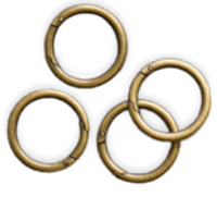
1.5" BRASS (4pk) $19.95