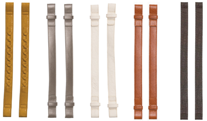
YELLOW SNAKE 35cm (set of 2) $29.95 SILVER 33cm (set of 2) $19.95 CREAM 33cm (set of 2) $19.95 CHESTNUT 33cm (set of 2) $19.95 BROWN 33cm (set of 2) $19.95