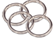
1.5" SILVER (4pk) $19.95 (2pk) $14.95