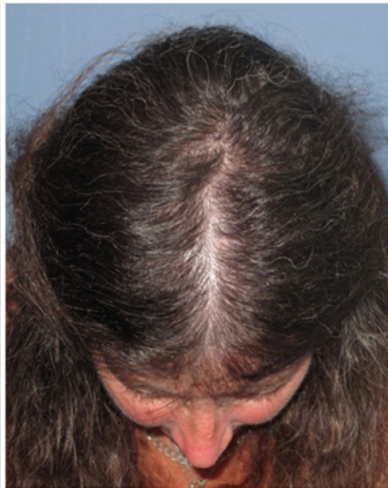
Baseline After 3 months