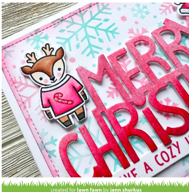
created for lawn fawn by jenn shurkus