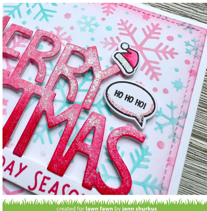
created for lawn fawn by jenn shurkus