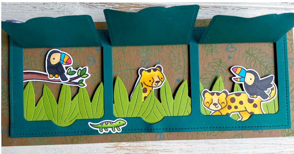
created for lawn fawn by jenn shurkus