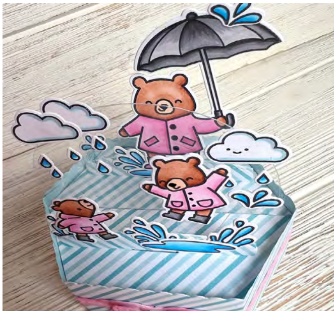
created for lawn fawn by jenn shurkus