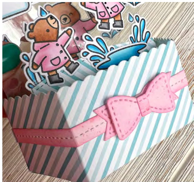
created for lawn fawn by jenn shurkus