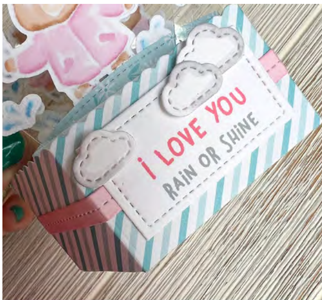
created for lawn fawn by jenn shurkus