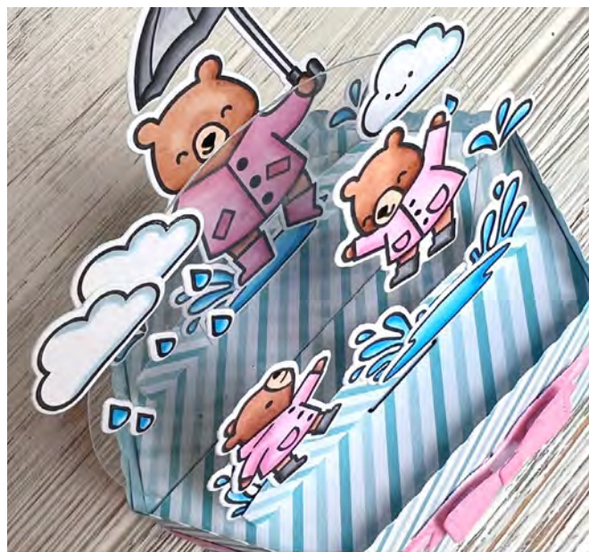
created for lawn fawn by jenn shurkus