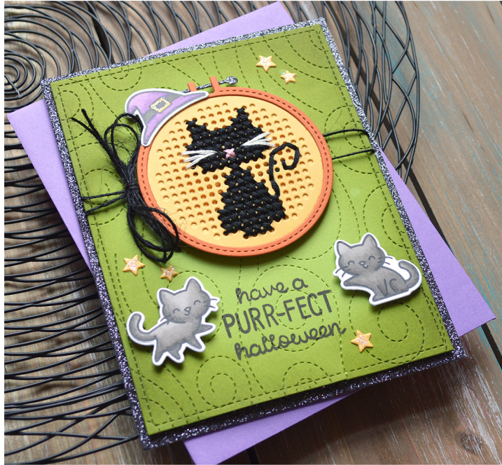
created for lawn fawn by chari moss

Pattern for Embroidery Hoop Lawn Cuts by Chari Moss