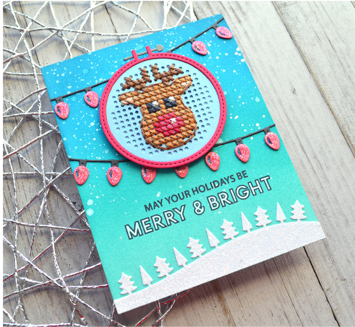
created for lawn fawn by chari moss

Pattern for Embroidery Hoop Lawn Cuts by Chari Moss