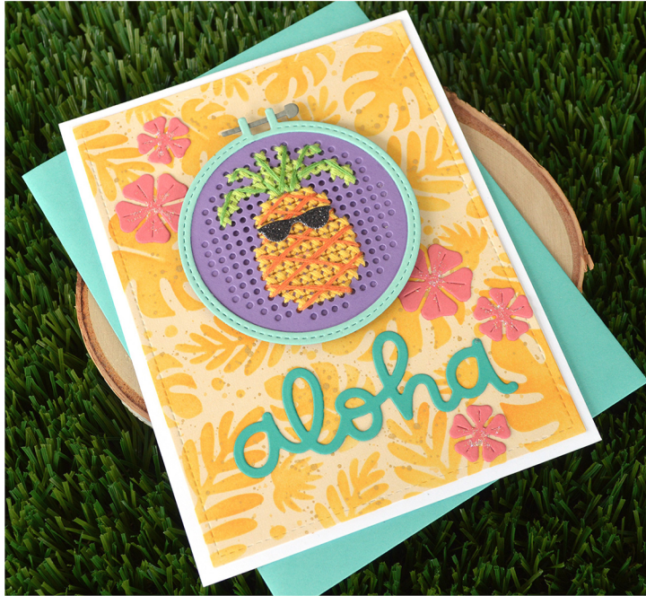
created for lawn fawn by chari moss

Pattern for Embroidery Hoop Lawn Cuts by Chari Moss