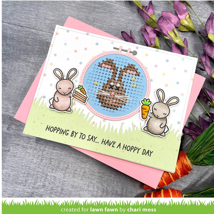
created for lawn fawn by chari moss

Pattern for Embroidery Hoop Lawn Cuts by Chari Moss