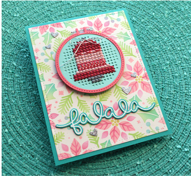
created for lawn fawn by chari moss

Pattern for Embroidery Hoop Lawn Cuts by Chari Moss