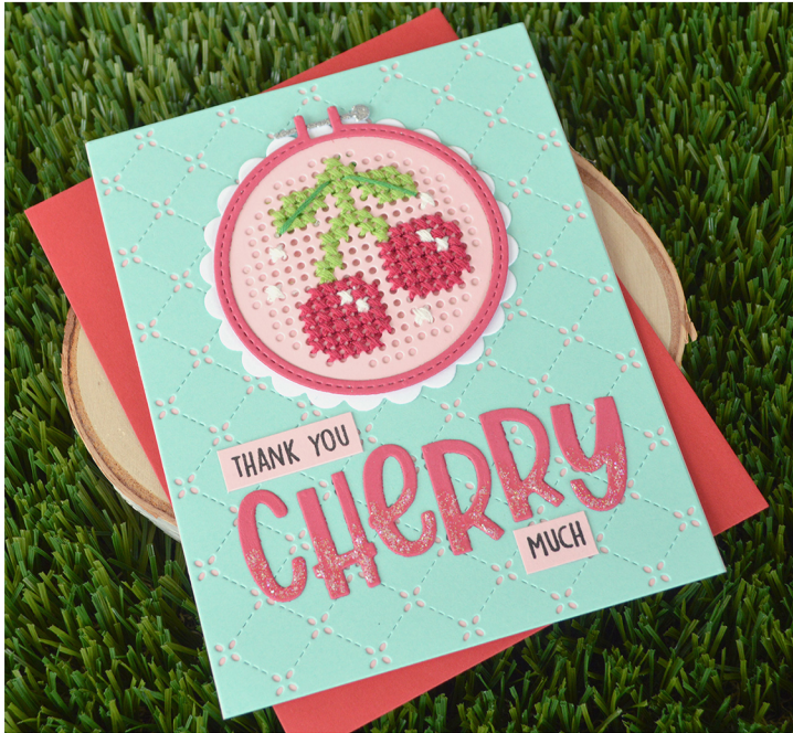
created for lawn fawn by chari moss

Pattern for Embroidery Hoop Lawn Cuts by Chari Moss