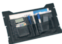
Office lid "standard" • Art n° 81200022