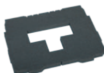
Filler pick & pluck foam, smooth, 1" (25 mm) • Art n° 81200014 Perforated cubes, 0.59" x 0.59" (15 x 15 mm) for quarrying out