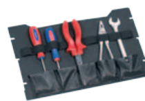
Tool lid • Art n° 81200026