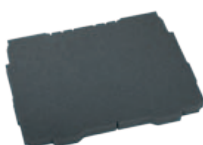
Base foam, smooth, 1" (25 mm) • Art n° 81200010