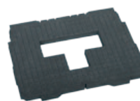
Filler pick & pluck foam, rigid, 1" (25 mm) • Art n° 81200018 Perforated cubes, 0.59" x 0.59" (15 x 15 mm) for quarrying out