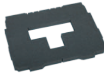
Filler pick & pluck foam, smooth, 1" (25 mm) • Art n° 81200014

Perforated cubes, 0.59" x 0.59" (15 x 15 mm) for quarrying out