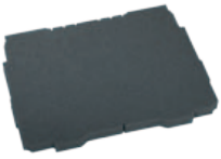
Base foam, smooth, 1" (25 mm) • Art n° 81200010