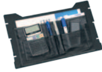
Office lid "standard" • Art n° 81200022