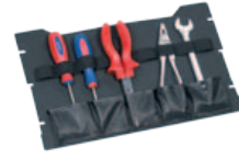
Tool lid • Art n° 81200026