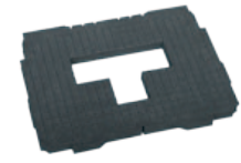
Filler pick & pluck foam, rigid, 1" (25 mm) • Art n° 81200018

Perforated cubes, 0.59" x 0.59" (15 x 15 mm) for quarrying out