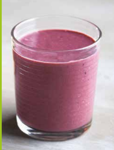
If you have a nut allergy, try using sunflower seed butter as a substitution.