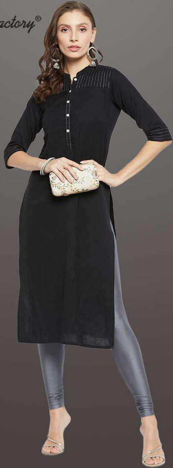
Model's Height - 5'6, Size - M