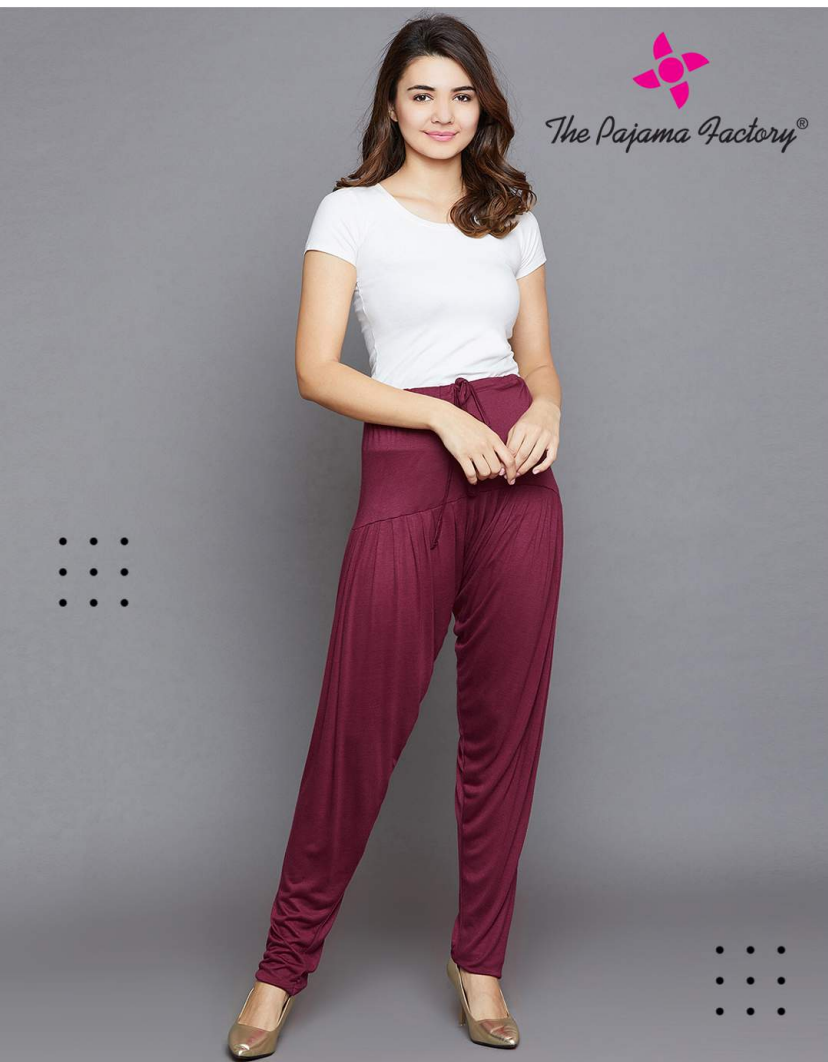
Model's Height - 5'6, Size - M