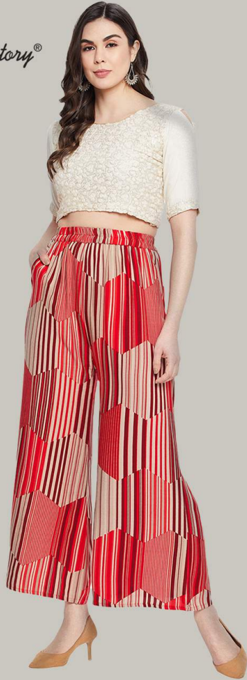
Model's Height - 5'6, Size - M