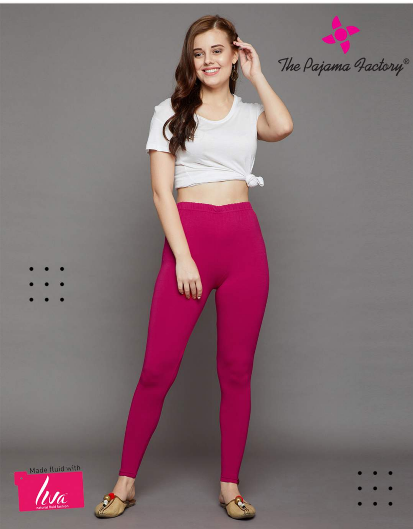
Model's Height - 5'6, Size - M