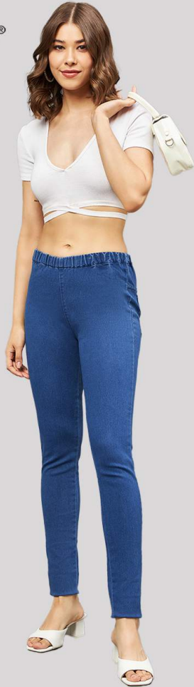
Model's Height - 5'6, Size - M