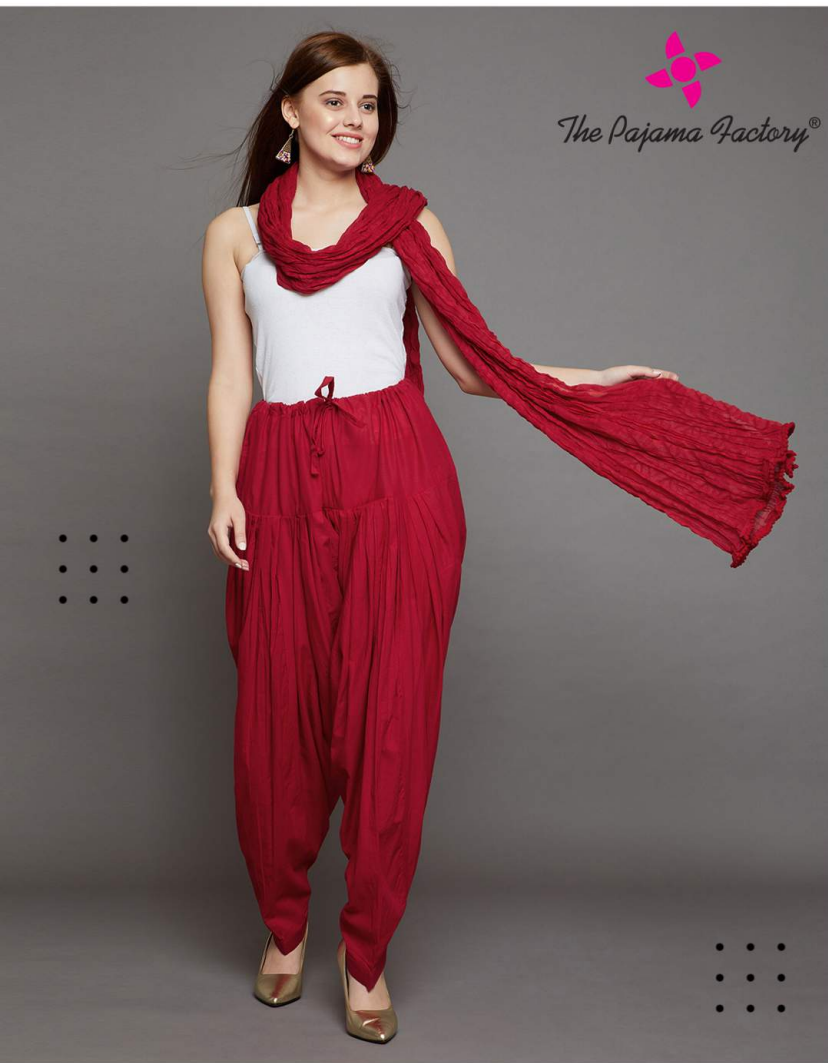
Model's Height - 5'6, Size - M