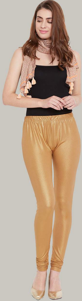
Model's Height - 5'6, Size - M