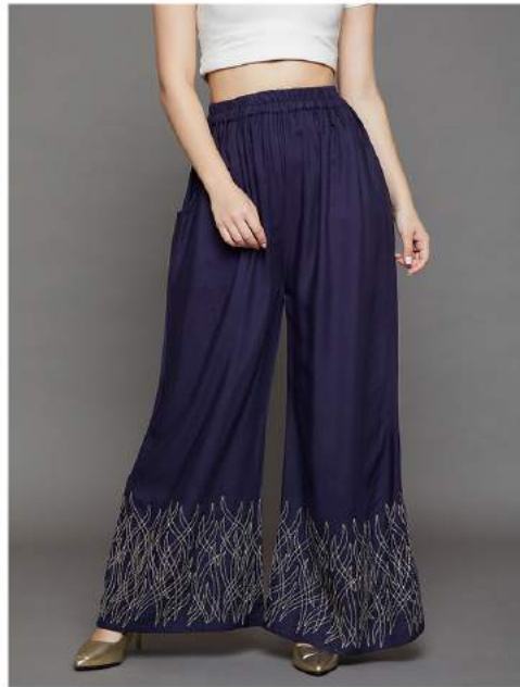
NAVY BLUE #01