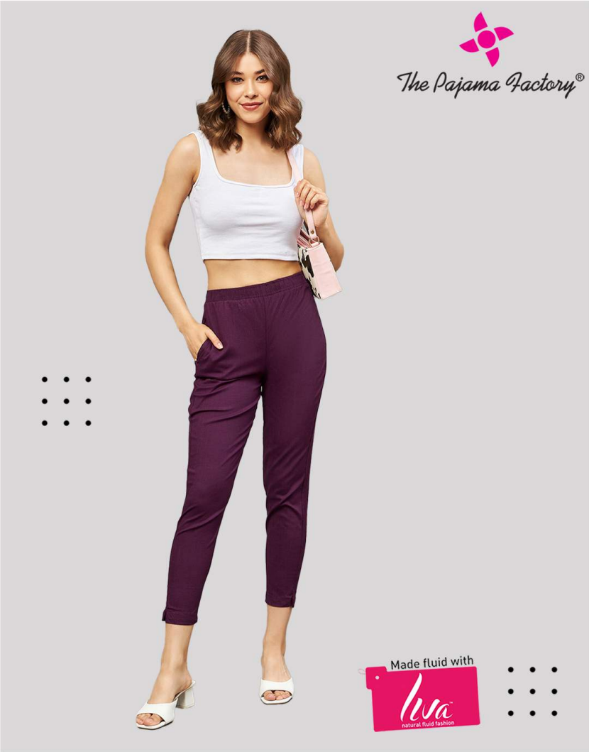
Model's Height - 5'6, Size - M