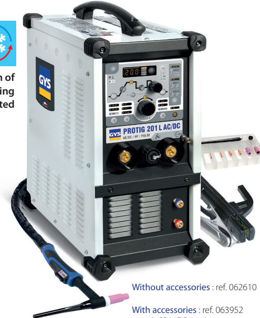
System of cooling integrated

PFC technology supresses peaks and regulates the supply current. Also allows the use of extension cords or generators and contributes to a better current stability during the welding phase.