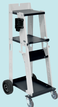
DENT 1000 trolley ref. 072848