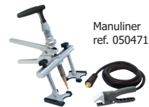
Manuliner ref. 050471