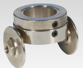
Trolley for MT-70 Torch 037977