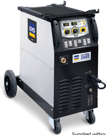
Supplied without accessories (031678)