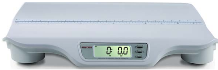
Figure 1-1. Rice Lake Digital Baby Scale