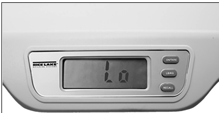
Figure 2-2. Low Battery Indicator

The RL-DBS-2 can also be powered by four AA batteries if an additional power source is not available. Replace the batteries or connect to an AC power source as soon as possible, if the low battery indicator ( Lo ) displays.