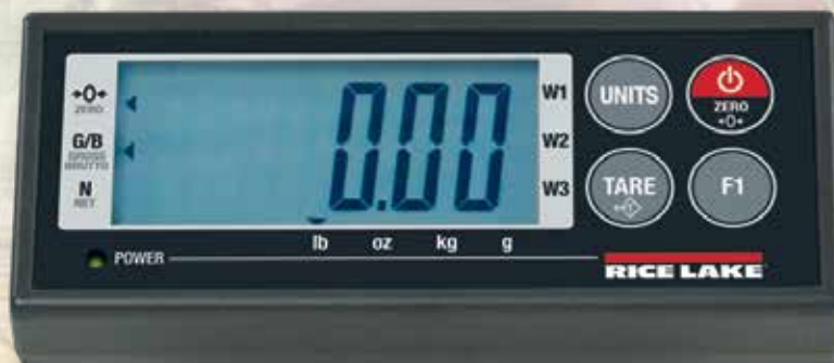
Large 1 inch configurable backlight setting